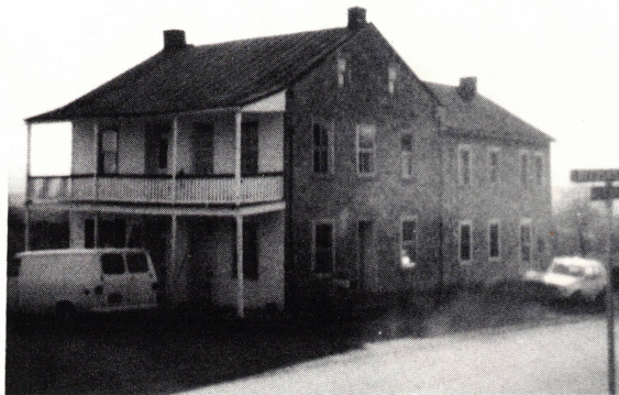
BLACK HORSE HOTEL