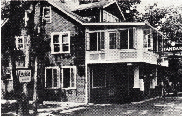
BLUE RIDGE PARK - SUMMIT STATION