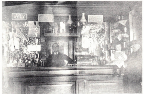
BAR OF THE BLACK HORSE HOTEL