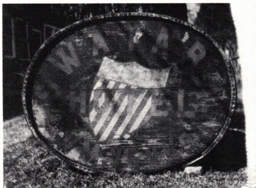
HOTEL ON FAUST FARM