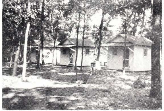
BLUE RIDGE PARK - SUMMIT STATION