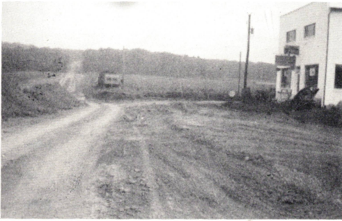
CONSTRUCTION OF 183