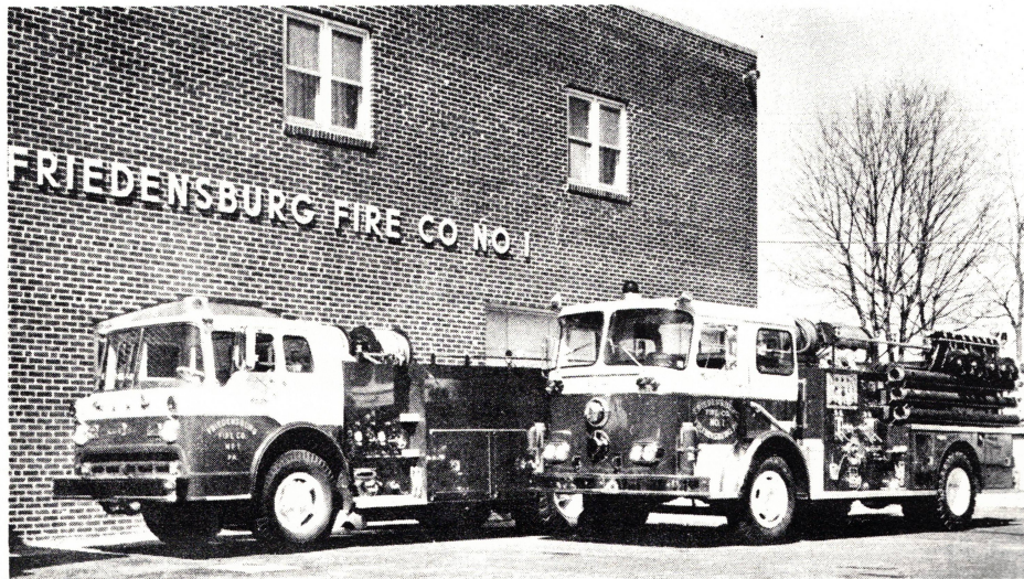
Fire Company Building & New Trucks May, 1965