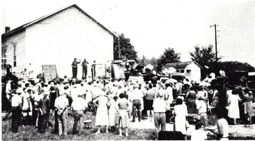
At Grange Building — August 18, 1961 — Auctioneers: Koch & Stump