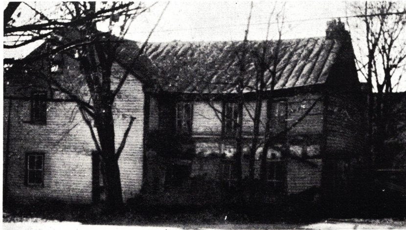
Top -Side view of Keller's Hotel.