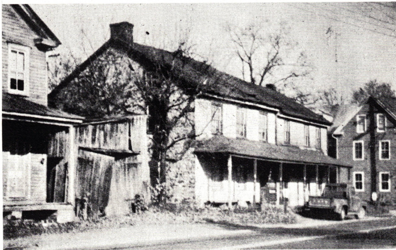
Former Keller's Hotel and Garages.